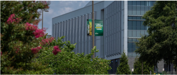
Science and Technology Campus