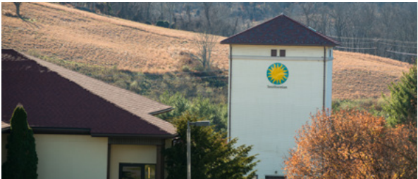
Smithsonian- Mason School of Conservation