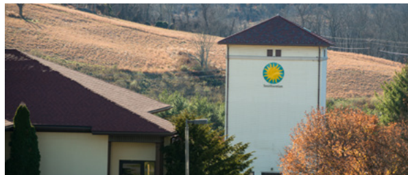
Smithsonian- Mason School of Conservation