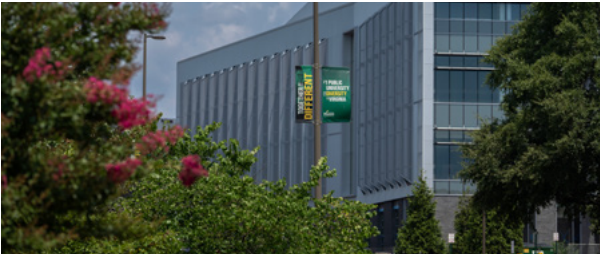
Science and Technology Campus