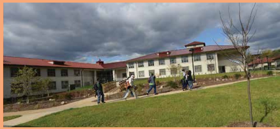
Smithsonian-Mason School of Conservation