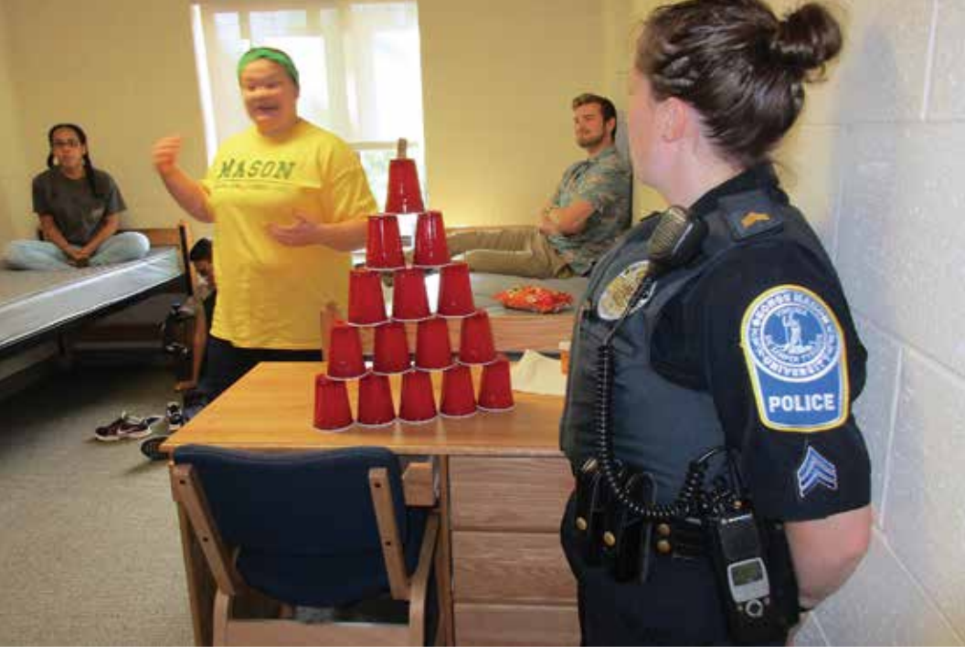
Captain Ross conducting alcohol awareness training with residential students