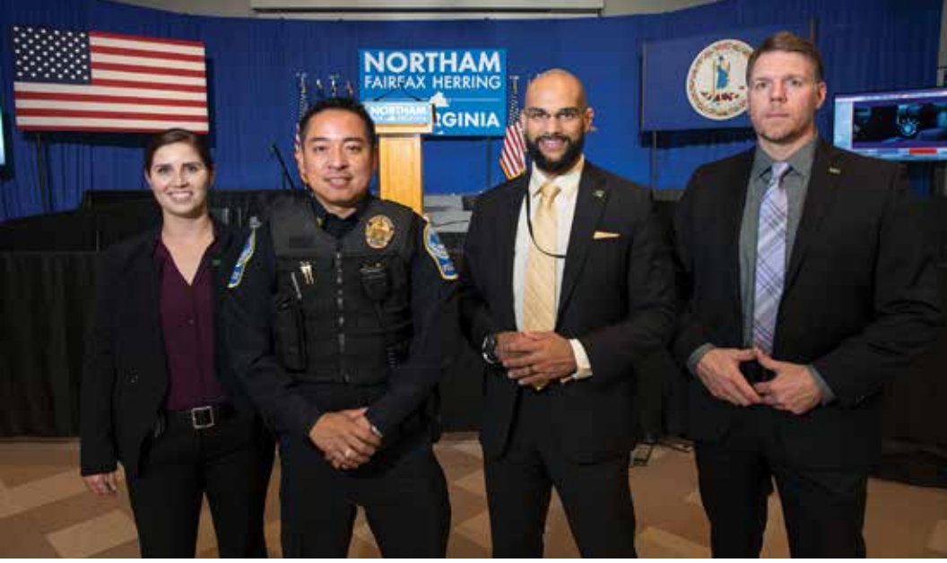
Mason Police officers conducting security operations for 2017 gubernatoral election.