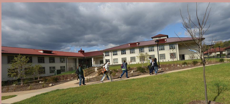
Smithsonian-Mason School of Conservation