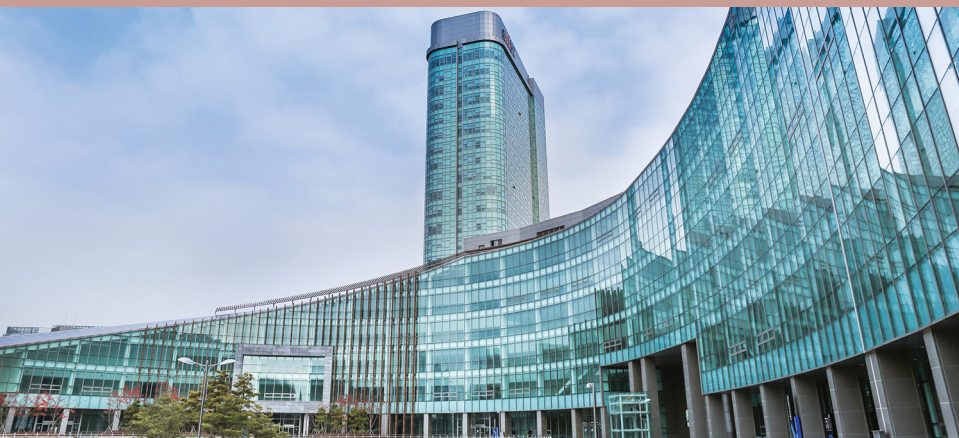
George Mason University Korea