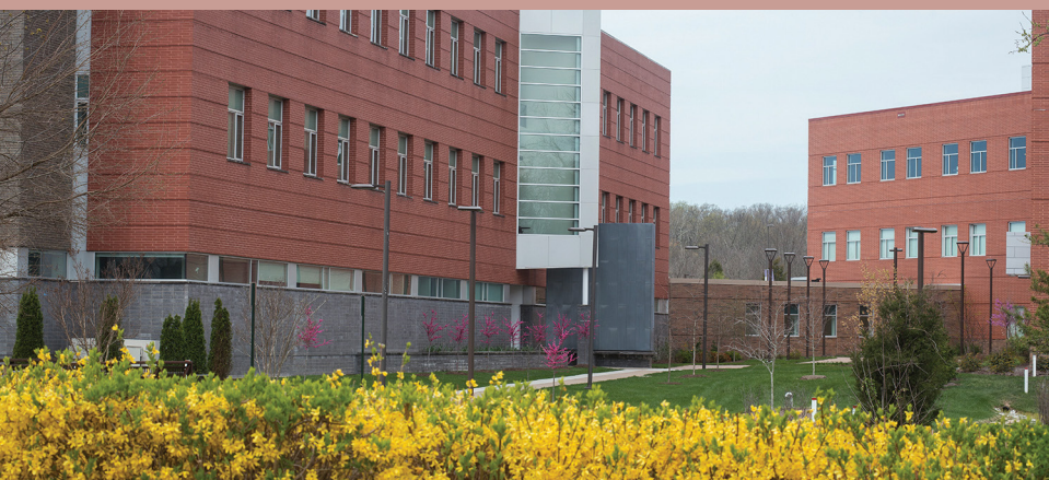
Science and Technology Campus