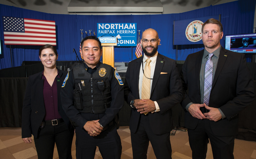
Mason Police officers conducting security operations for 2017 gubernatorial election.