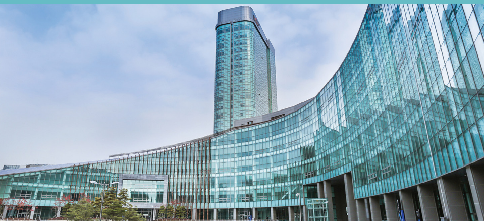
George Mason University Korea