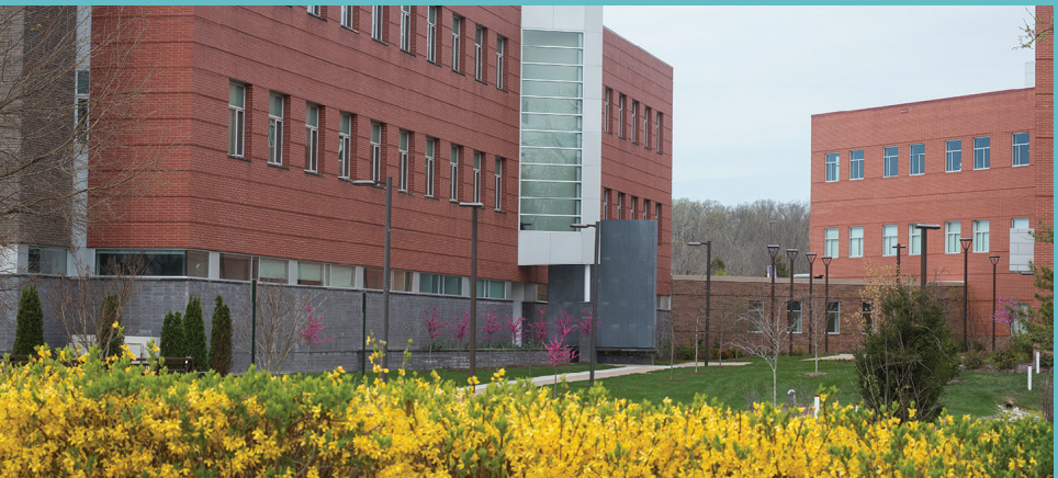
Science and Technology Campus