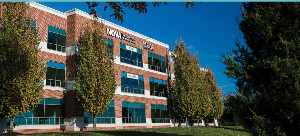
Mason in Loudoun