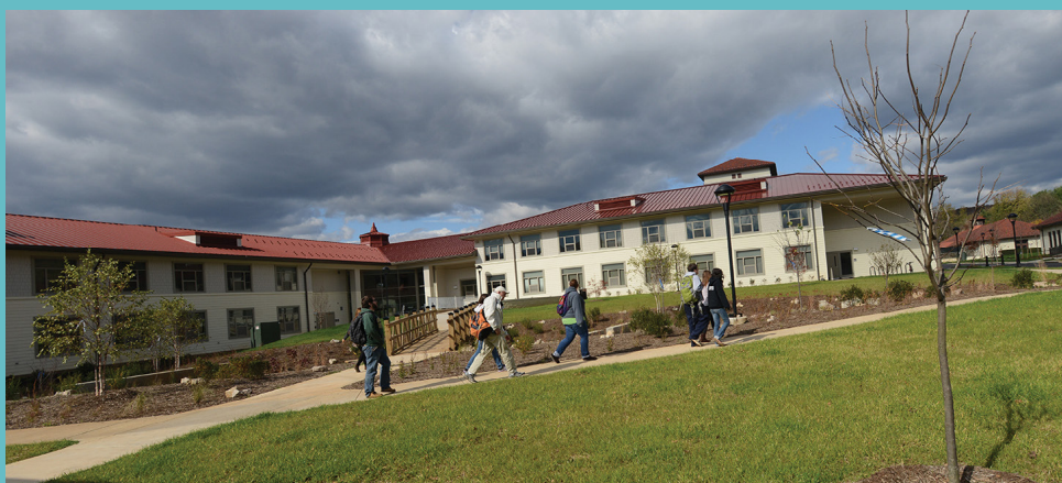
Smithsonian-Mason School of Conservation