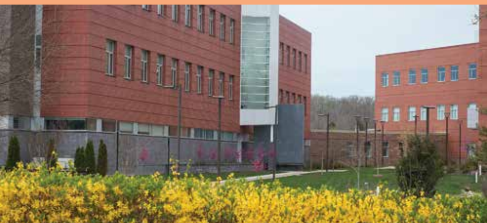
Science and Technology Campus