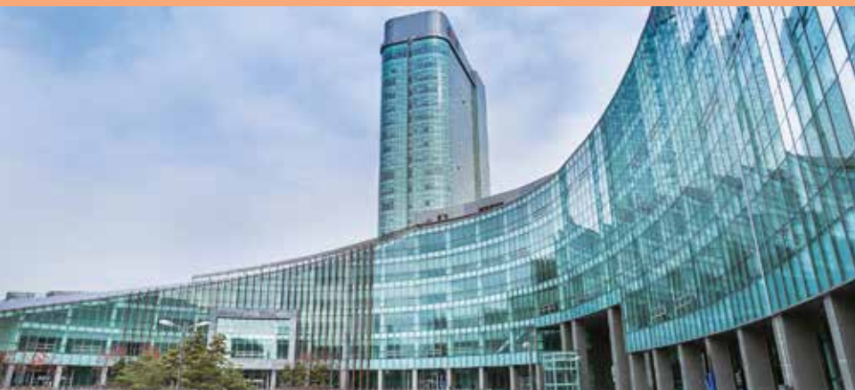
George Mason University Korea