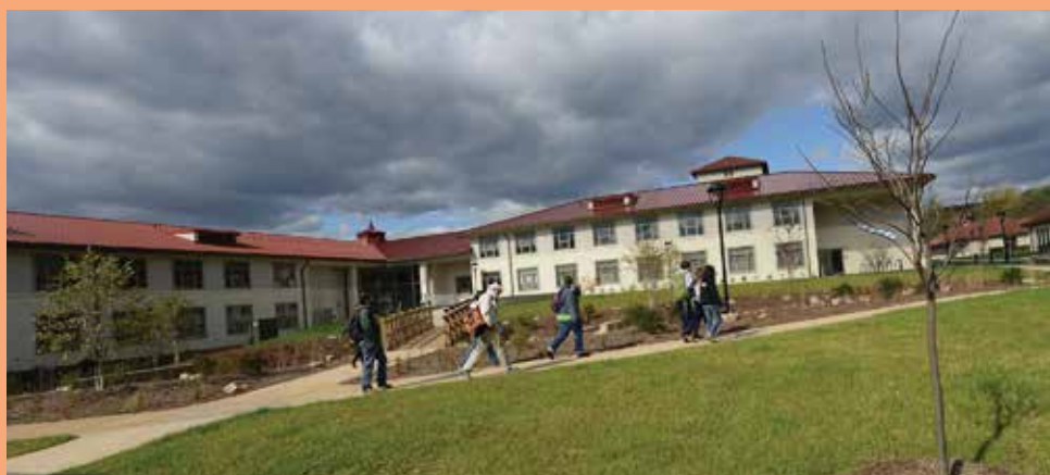
Smithsonian-Mason School of Conservation