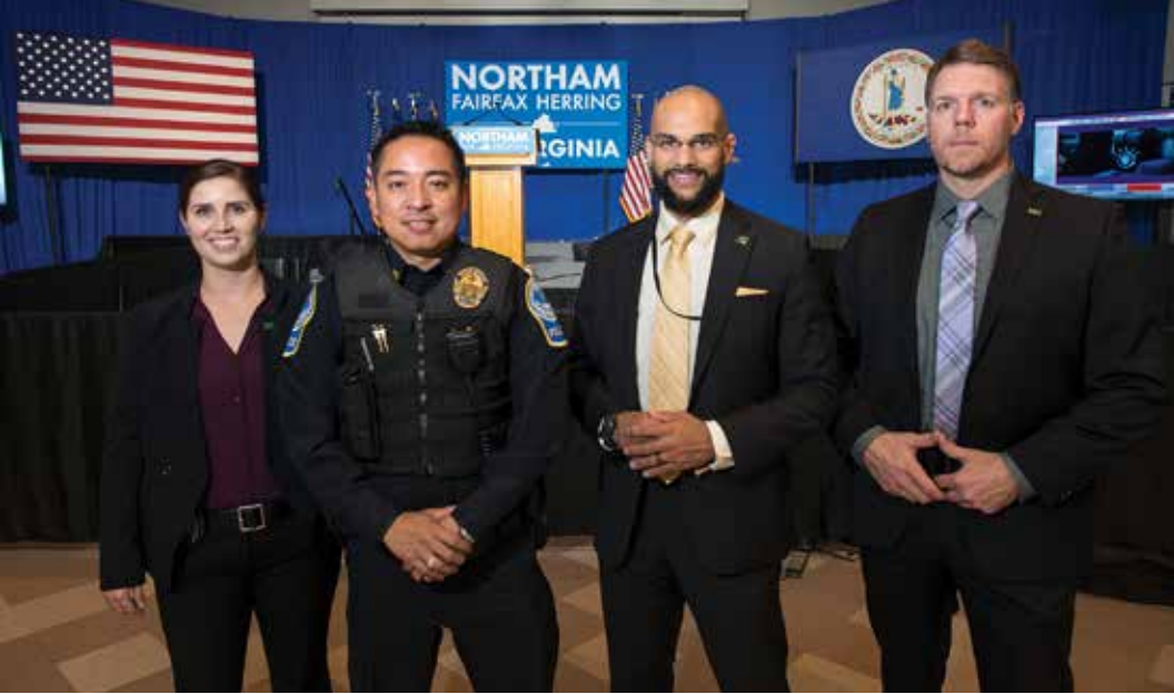
Mason Police officers conducting security operations for 2017 gubernatorial election.