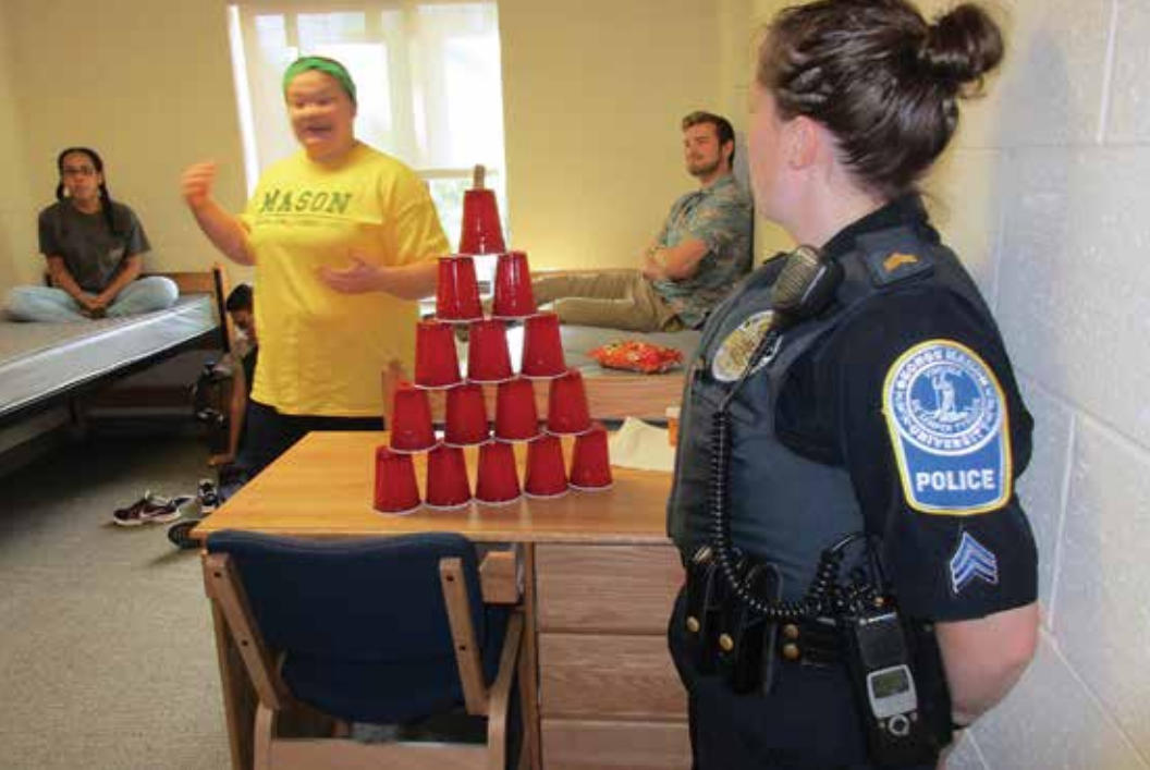
Captain Ross conducting alcohol awareness training with residential students