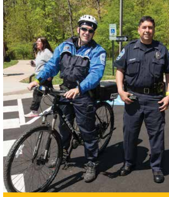
University Police officers at the 17th annual Victim's Rights 5K Run and Walk at the Fairfax Campus.

The abuse of drugs and alcohol by employees is incompatible with the goals of Mason. The illicit use of drugs and alcohol could create a serious threat to the safety and welfare of the university community, as well as undermine the productivity and success of its members. In compliance with the Drug-Free Schools and Communities Act Amendments of 1989, the following information regarding drugs and alcohol is provided to the university community on an annual basis. It is important that all members of the Mason community understand the health risks and legal consequences of substance abuse.