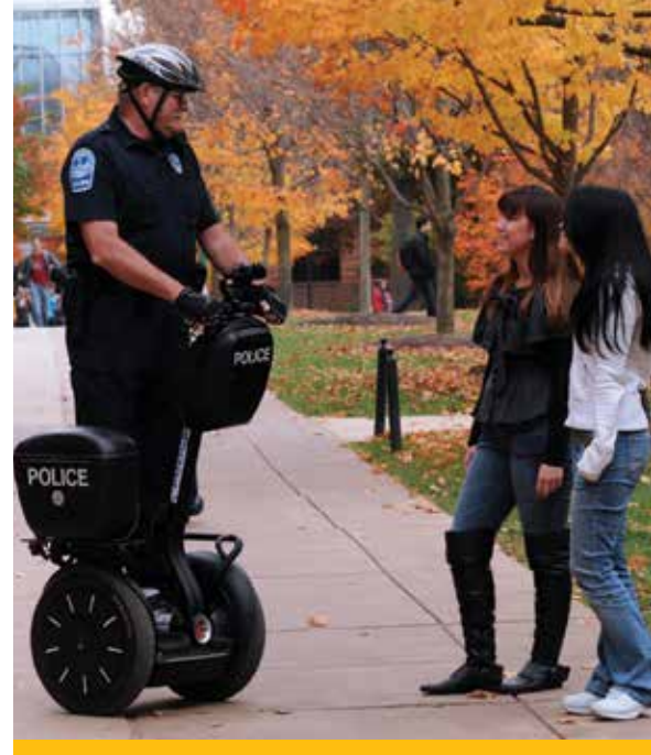
The University Police often uses Segways to patrol pathways on campus.

Mason is compliant with the Jeanne Clery Disclosure of Campus Security Policy and Campus Crime Statistics Act (the Clery Act) as amended in 1998, which requires all postsecondary institutions to publish and distribute certain information regarding campus crimes, including reports of campus sexual assault, sexual assault policies, and security programming to all current students, employees, and any applicant who requests such information.