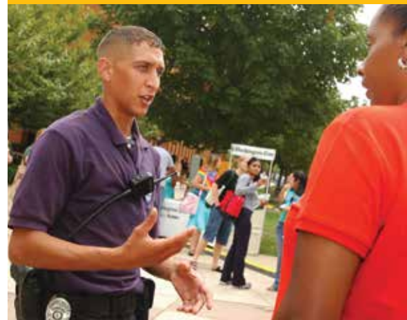
Participation in campus events helps promote safety awareness.