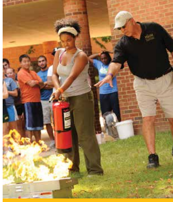
All resident advisors go through training sessions prior to the start of fall semester.