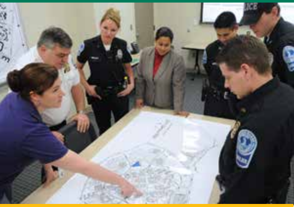
Mason's University Police maintains close working relationships with local police departments.