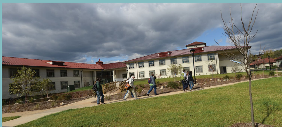
Smithsonian-Mason School of Conservation