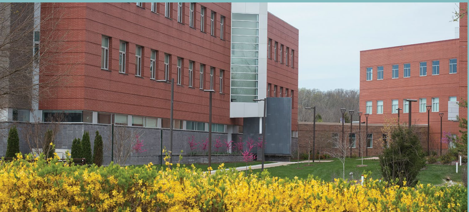
Science and Technology Campus