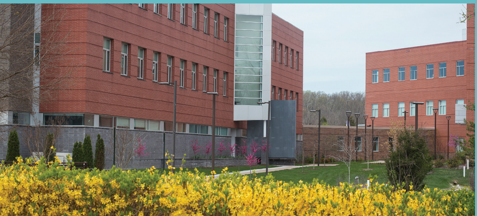
Science and Technology Campus