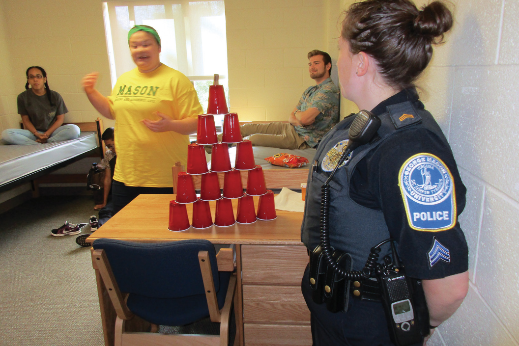
Deputy Chief Ross conducting alcohol awareness training with residential students