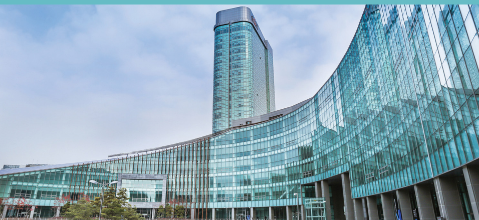
George Mason University Korea