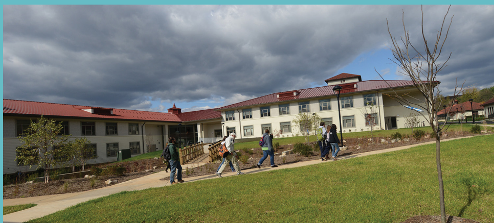
Smithsonian-Mason School of Conservation