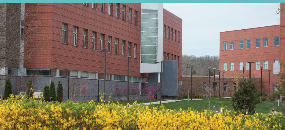
Science and Technology Campus