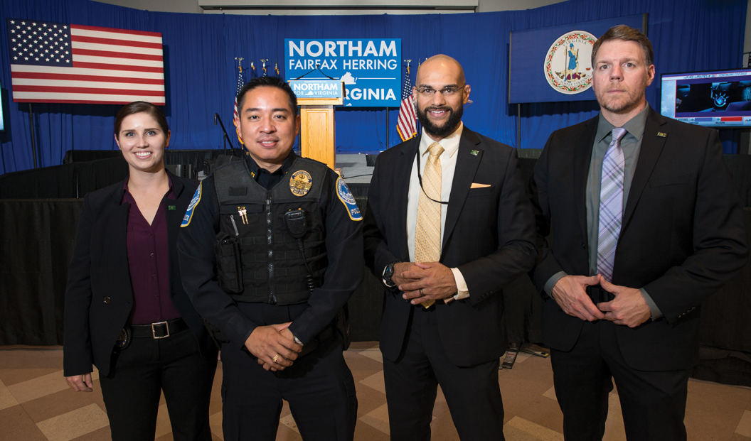
Mason Police officers conducted security operations for a 2017 gubernatorial election event.