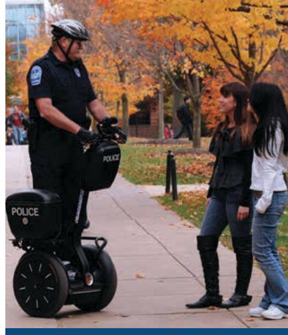
The University Police often uses Segways to patrol pathways on campus.

Mason is compliant with the Jeanne Clery Disclosure of Campus Security Policy and Campus Crime Statistics Act (the Clery Act) as amended in 1998, which requires all postsecondary institutions to publish and distribute certain information