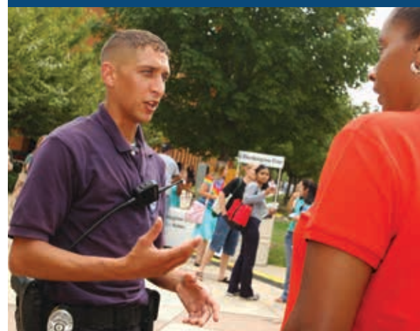
Participation in campus events helps promote safety awareness.