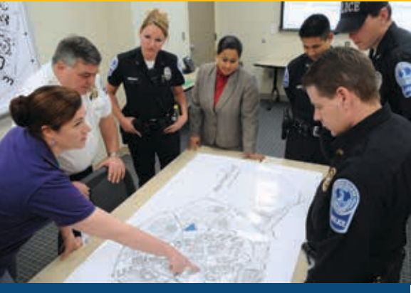
Mason's University Police maintains close working relationships with local police departments.

The bicycle patrol enhances communication between officers and persons on campus and improves response time.