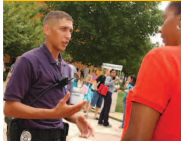
Participation in campus events helps promote safety awareness.