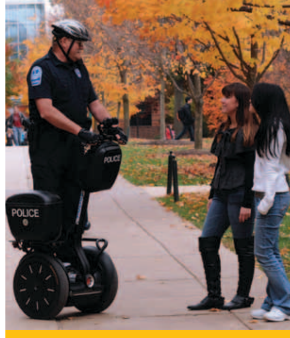
The University Police often uses Segways to patrol pathways on campus.

Mason is compliant with the Jeanne Clery Disclosure of Campus Security Policy and Campus Crime Statistics Act (the Clery Act) as amended in 1998, which requires all postsecondary institutions to publish and distribute certain information