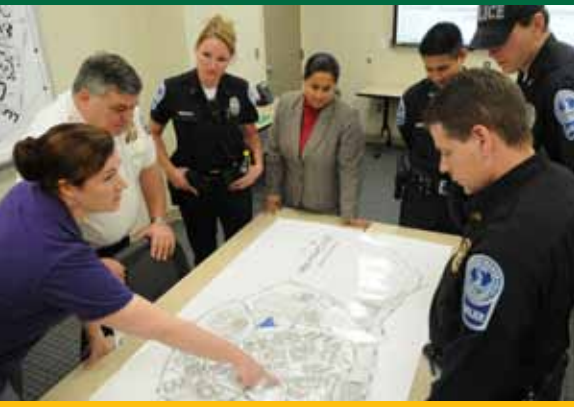
Mason's University Police maintains close working relationships with local police departments.

The bicycle patrol enhances communication between officers and persons on campus and improves response time.